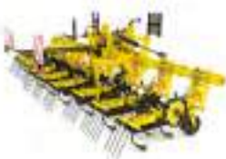
ROW-MASTER Inter-row Cultivator