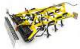
FENIX Versatile Cultivators