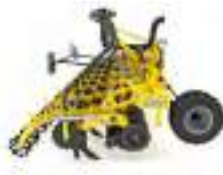
STRIP-MASTER Strip-till cultivators