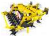
TERRALAND Chisel Ploughs