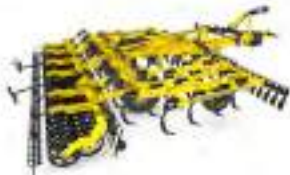
VERSATILL Versatile Cultivators