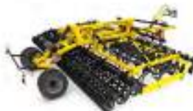
SWIFTER Seedbed Cultivators