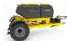
COMBO SYSTEM Seed Hopper