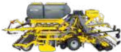
OMEGA Seed Drills