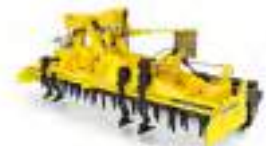
KATOR Rotary harrow