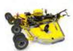
MULCHER Rotary Cutters

BEDNAR FMT, s. r. o. Lohenicka 607 190 17 Praha-Vinor Czech Republic