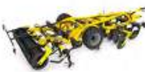
ACTROS Combined cultivators