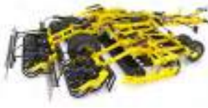
ATLAS Disc Cultivators