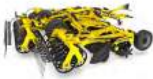
SWIFTERDISC Disc Cultivators