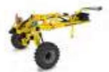
CADDY Universal Carrier