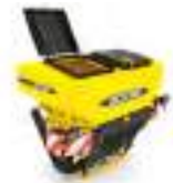
FERTI-BOX Hopper for Fertilizer